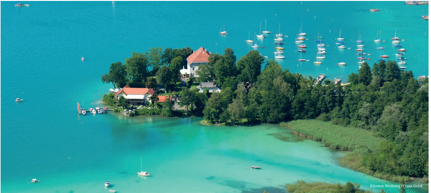
Kärnten Werbung / Franz Gerdl