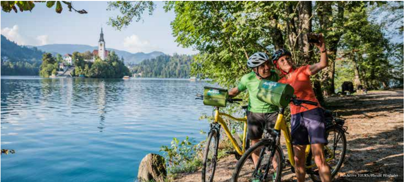
FunActive TOURS / Harald Wisthaler