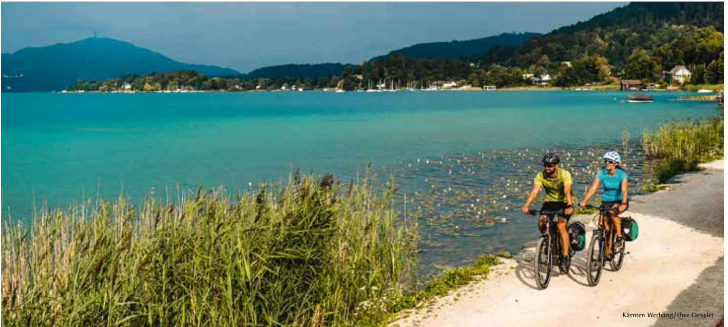
Kärnten Werbung/Uwe Geissler