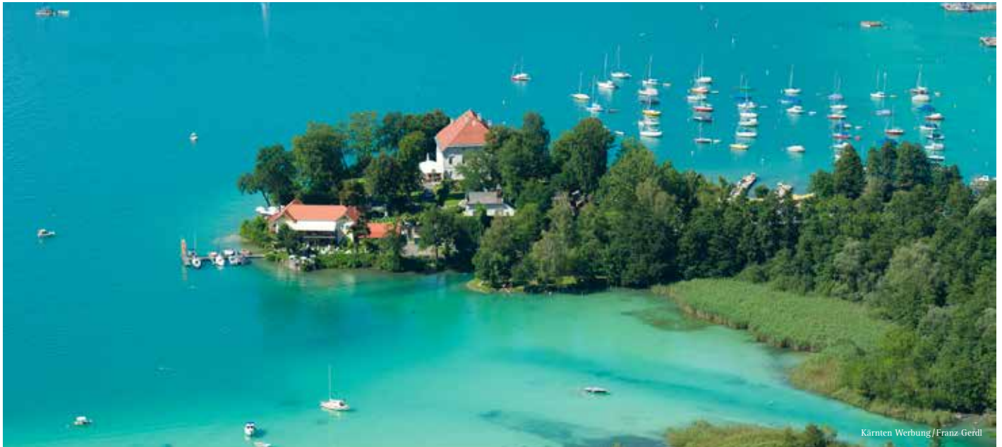
Kärnten Werbung/Franz Gerdl